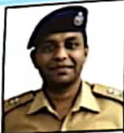
आयुष अग्रवाल (IPS) SSP, STF (उत्तराखण्ड)